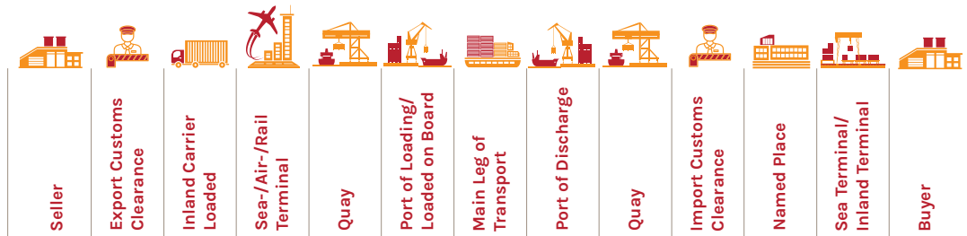
Risks and Costs from Seller to Buyer